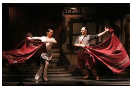
Duration: 2 - 2.30 hours. Shared Services. Beverages included.

Famous for its amazing nightlife and for being the land of Carlos Gardel, Buenos Aires countless gastronomic and artistic options. Tango portrays the 'Queen of the River Plate' ('Reina del Plata'). We will enjoy an unforgettable night, surrender to the