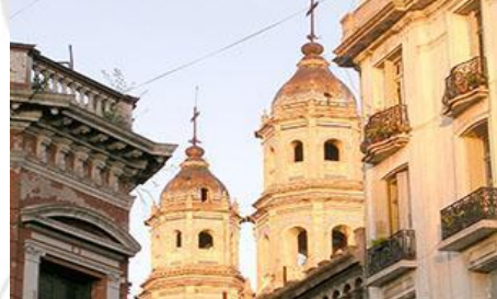
Duration: 4 hrs approx. Hightlights: Recoleta - Palermo - Plaza de Mayo - Puerto Madero - San Telmo - La Boca

This is the perfect tour to discover the charm of Argentina's capital, from the chic districts of Recoleta and Palermo, to historic Plaza de Mayo, and architectural icons such as the Colon opera house, the Metropolitan Cathedral and the palace of Congress. The program finishes in old town San Telmo, home of the city's aristocracy until the late 19th century; Caminito street, in La Boca, the colorful shelter for Italian immigrants by the Riachuelo, and the young thriving restaurant scene at the Puerto Madero waterfront.