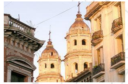
Duration: 4 hrs approx. Hightlights: Recoleta - Palermo - Plaza de Mayo - Puerto Madero - San Telmo - La Boca

This is the perfect tour to discover the charm of Argentina's capital, from the chic districts of Recoleta and Palermo, to historic Plaza de Mayo, and architectural icons such as the Colon opera house, the Metropolitan Cathedral and the palace of Congress. The program finishes in old town San Telmo, home of the city's aristocracy until the late 19th century; Caminito street, in La Boca, the colorful shelter for Italian immigrants by the Riachuelo, and the young thriving restaurant scene at the Puerto Madero waterfront.