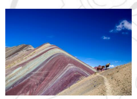
OPTIONALS WITH EXTRA COST: