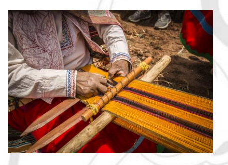
F/D HISTORY AND CULTURE IN MARAS, MORAY & MISMINAY

You will head in the direction of the Maras salt mines, an amazing place where the finest salt in the world is extracted: Maras salt. On the way, you will make a stop at the Ragchi viewpoint, from where you will have an impressive view of the Sacred Valley of the Incas. Then, you will visit the Misminay community. Upon arrival, the villagers will give you a warm welcome with music and typical dances. There, you will be able to learn about the Andean families' lifestyle, by sharing some of their daily activities with them. Then, you will enjoy a delicious and traditional lunch prepared with local products. You will continue with a visit to Moray, a fascinating archeological site with huge concentric terraces, which the Incas used as a botanical laboratory.