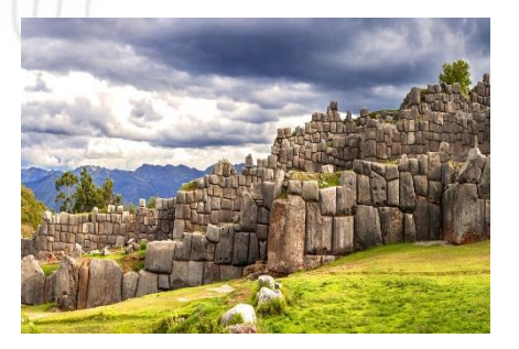
OPTIONAL WITH EXTRA COST: