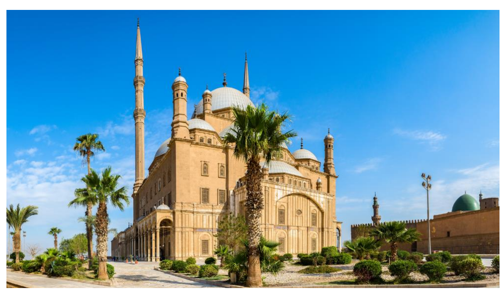
Day 9 : Cairo - Alexandria - Pompey - Cemetery - Cairo