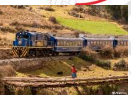
Board train in Aguas Calientes, to Ollantantaytambo, and transfer back to Cusco.